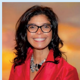
ANA WHITE Development