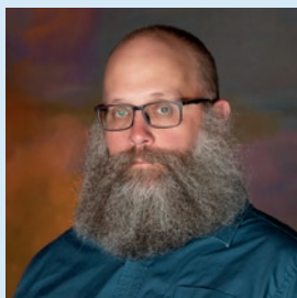
FRED PARK Production