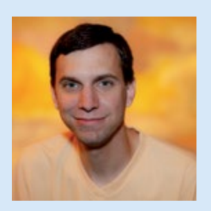
JORDAN MILLER Production