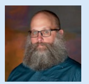
FRED PARK Production